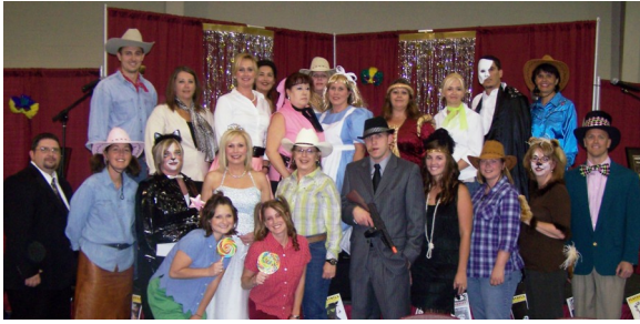
PTSC's staff dressed as a Broadway character for the Celebrity Dinner in September.

In March of 2011, PTSC will celebrate having given out over $100,000 in scholarships to area students. They will hold a special "Celebrity Dinner" in Mountain Grove to celebrate this great ac-